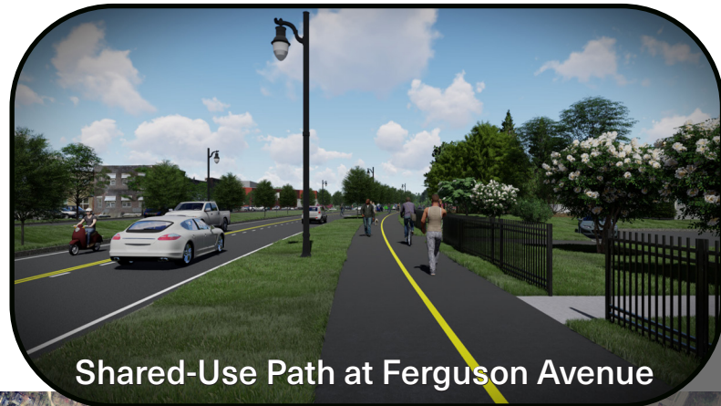
Shared-Use Path at Ferguson Avenue