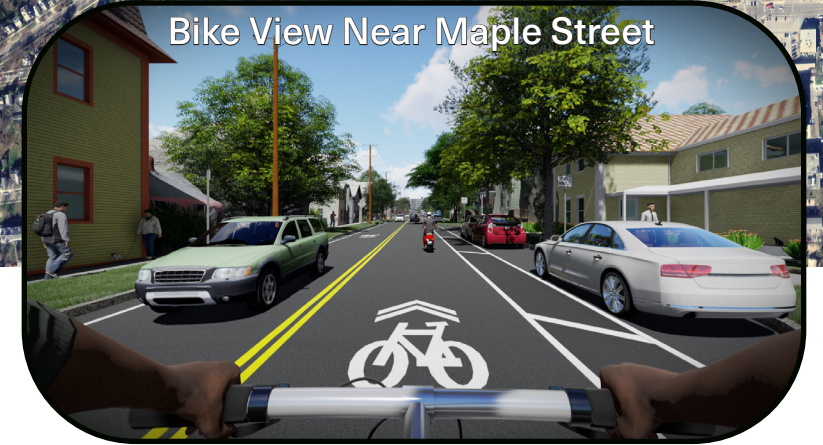
Bike View Near Maple Street

The Champlain Parkway will IMPROVE ACCESS between the I-189/U.S. Route 7 Interchange to the Burlington City Center District and downtown waterfront area; IMPROVE CIRCULATION, MOBILITY, AND SAFETY on local streets; PROVIDE TRAFFIC RELIEF in the southwestern quadrant of Burlington; eliminate disruption to local neighborhoods; SEPARATE LOCAL AND THROUGH-TRAFFIC ; and REDUCE TRUCK TRAFFIC on the local street network.