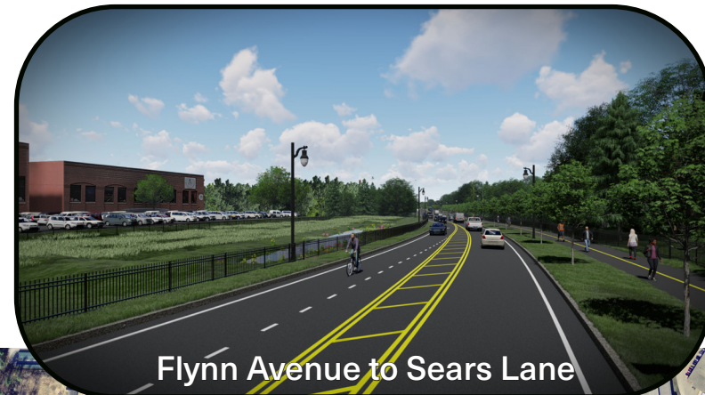
Flynn Avenue to Sears Lane