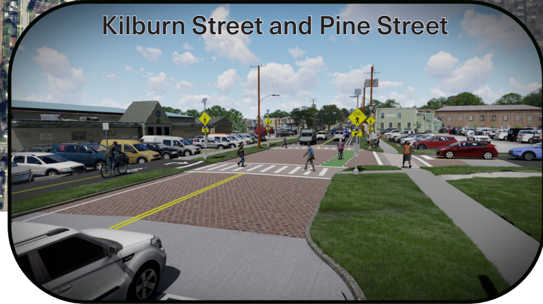
Kilburn Street and Pine Street