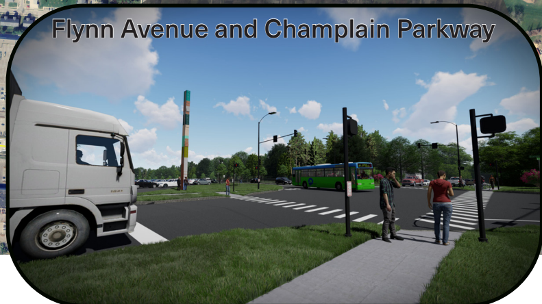
Flynn Avenue and Champlain Parkway