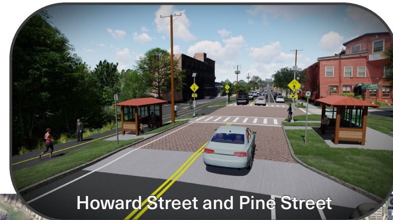
Howard Street and Pine Street